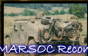
MARSOC Recon "Wolfpack-4"